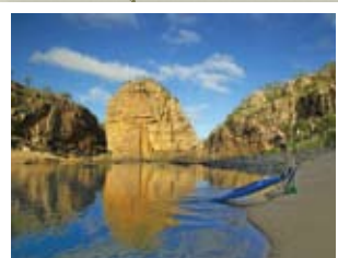
Kayak safari through Katherine Gorge