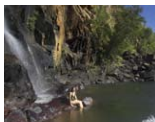
Cool down at Northern Rockhole, Nitmiluk National Park