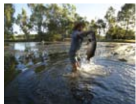
View a feeding frenzy at Mataranka