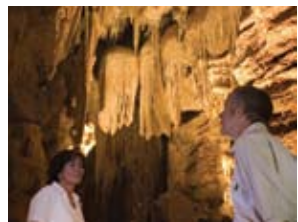
Cutta Cutta Caves Nature Park