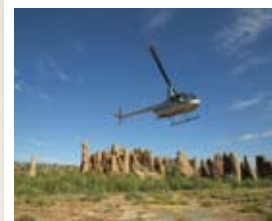
Take a scenic flight over the Lost City, Cape Crawford.

← Keep River National Park (24km) Western Australia (94km)