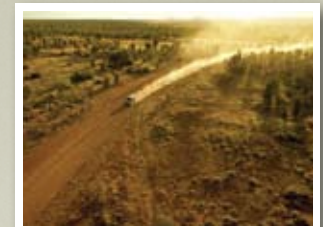
Buchanan Highway, Savannah Way

A great destination for caravanners, a four-wheel drive is not a necessity for travel around the Katherine region, although there's exciting unsealed roads for the more adventurous.