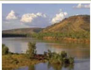
Take in the beautiful landscape of Victoria River