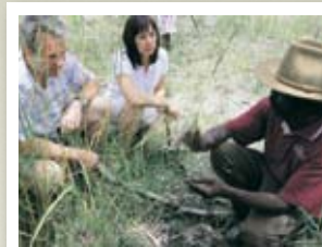
Tours at Manyallaluk