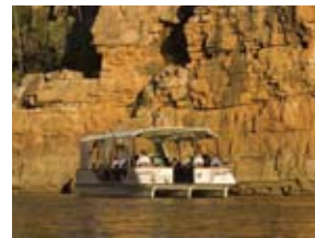
Cruising down Katherine Gorge