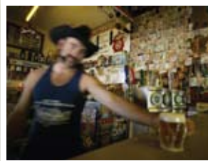
Visit a classic Australian watering hole, the Daly Waters Pub.