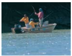
Catch a 'barra' on the Daly River